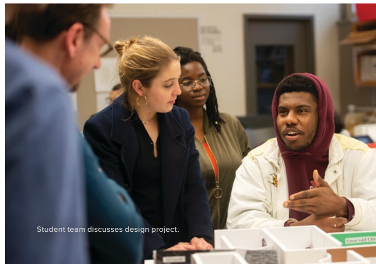
Student team discusses design project.