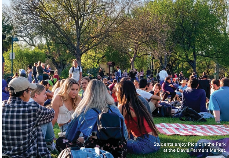
Students enjoy Picnic in the Park at the Davis Farmers Market.