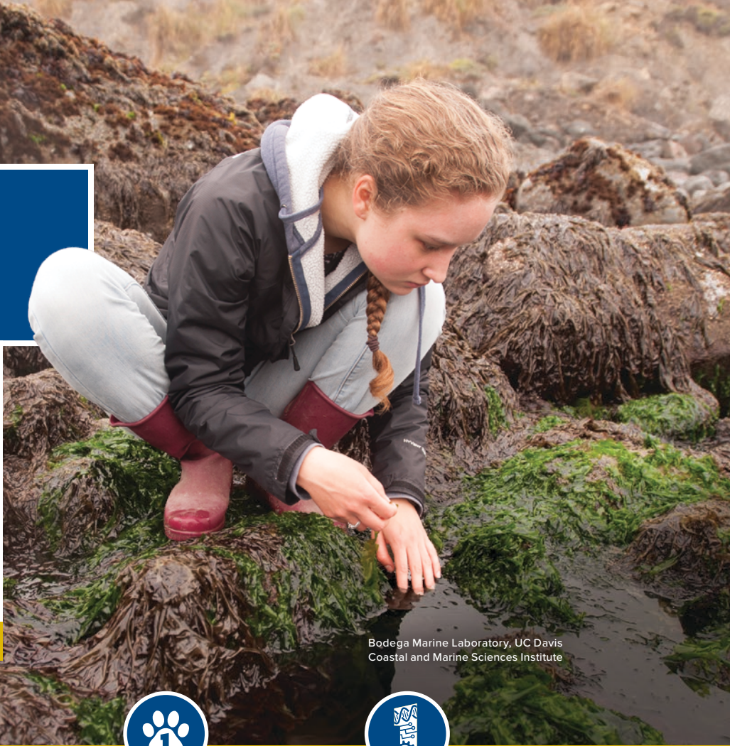
Bodega Marine Laboratory, UC Davis Coastal and Marine Sciences Institute